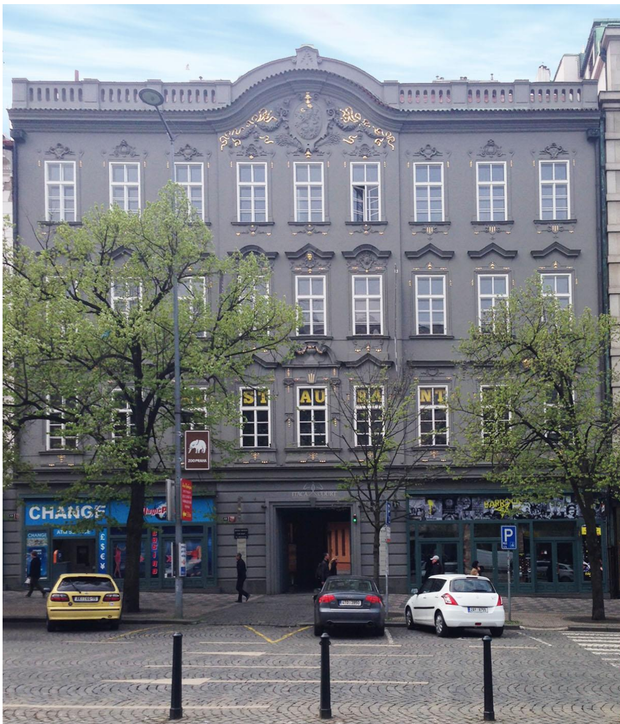
Fig. 3: Original seat of the Provincial Statistical Office at Wenceslas square. no. 799/II 11

statistical office) and of Provincial Statistical Chair as an executive authority. The statistical office was established by taking over the personnel and equipment of the statistical office of the Agricultural Council and in the early years remained in the building of Agricultural Council (Wenceslas Square. No. 799 / II - opposite today's Hotel Jalta – see Fig. 3).